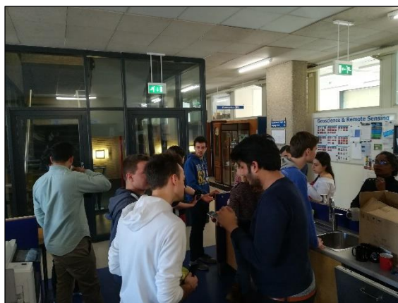
Figure 1: Snapshot from last months "Department Drinks"

2.3 Flyer spreading during our “Department Drinks”: Snellius organises a monthly get-together with students, PhD students and teachers where they share ideas, talk about upcoming events and thesis projects while enjoying a cup of coffee and some snacks. During this get-together Snellius can distribute flyer with promotion for employment offers, thesis / traineeship / or internship offers or whatever our partner has in mind.