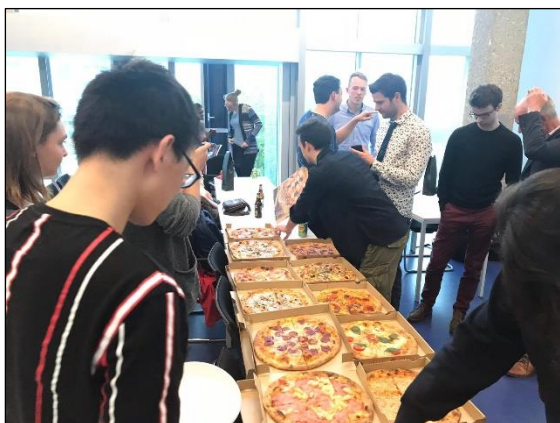
Figure 3: Company Event with Pizza afterwards

3.3 Company presentation + Dinner with Pizza & Drinks: With an evening presentation at TU Delft, our partner can introduce the company, share recent projects and pitch ideas for e.g. internship offers while dinner will be provided by Snellius (Pizza or other options). Since there are no lectures after this type of presentation, the talks are always well-attended and enable the partner to swap ideas with students (even longer) after the actual presentation. It goes without saying that there's no better chance to interchange!