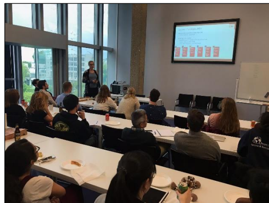
Figure 2: Afternoon company presentation with drinks

3.2 Company presentation + Drinks: Holding a company presentation at TU Delft, you as our partner can provide insights into your employees profession and daily work. With the chance to find a potential intern or trainee in the audience, company lectures / presentations are always highly appreciated among students! After the presentation Snellius provides drinks and snacks for a get together with you and the students.