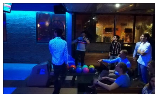
Figure 4: Bowling Evening with with our partners

4.1 Bowling Evening with students: One activity where we had lots of fun in the past and great feedback by our partners are bowling evenings! If you would like to interchange with students while showing off your skills in some rounds of bowling then you should not hesitate to become a Gold Sponsor!